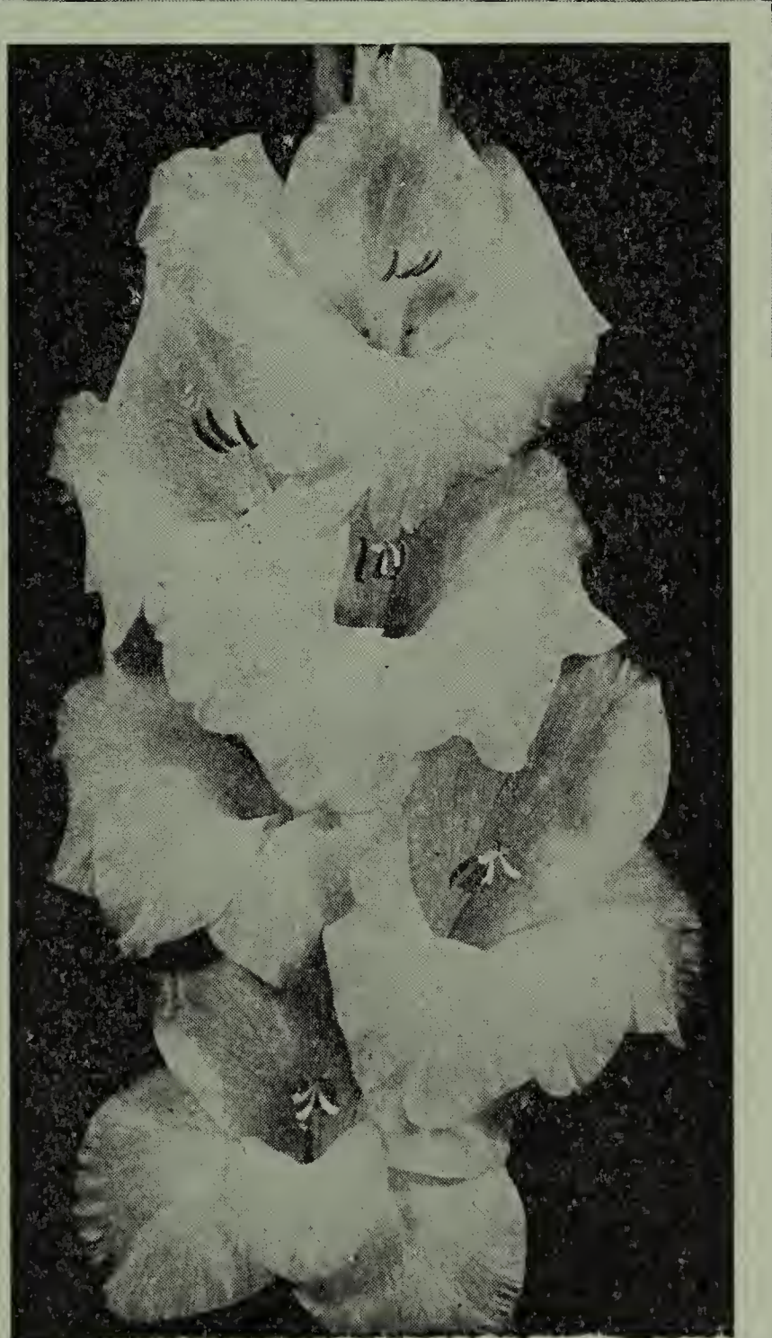
Red Phipps—"Red that IS Red"

Wholesale Prices F. O. B.—Pages 24 and 25.